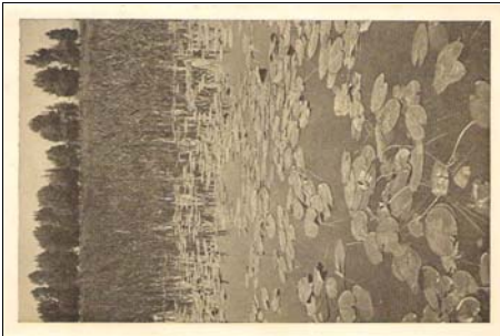
Image: marsh Text: "Hulch: One of the marshes which the JNF is draining." Notes: Price: D